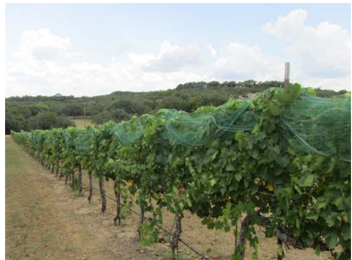
Healthy vines after treating with Topguard Terra fungicide.