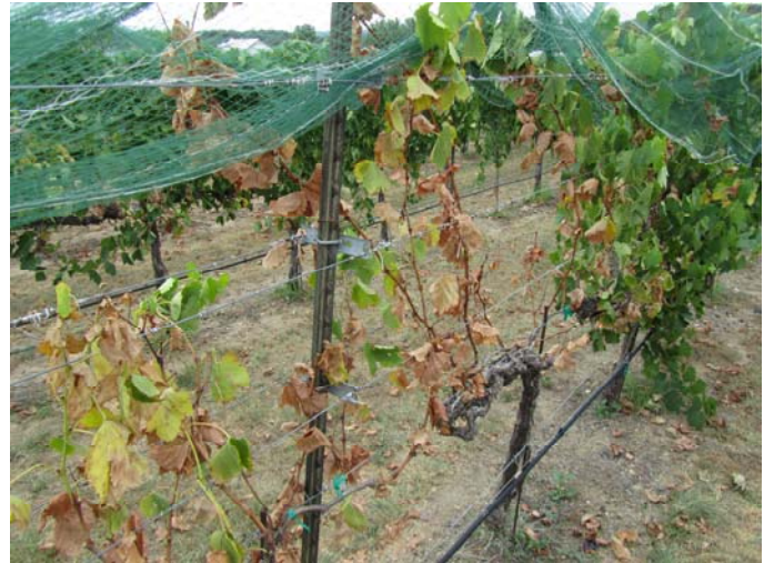
Texas root rot symptoms show rapid death of vines in late season. Death is usually so rapid, desiccated leaves remain on the vine.

Make initial application between 30 to 60 days after bud break. If a split application is desired, make second application no closer than 45 days after first application but not within 14 days of harvest. The second application may be applied postharvest to manage late season disease.