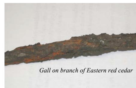
Gall on branch of Eastern red cedar